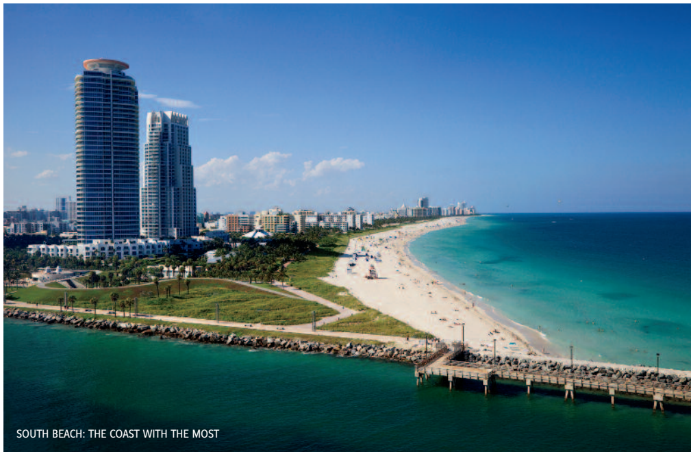
SOUTH BEACH: THE COAST WITH THE MOST