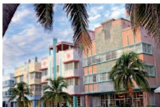
ART DECO ON OCEAN DRIVE

To cap off your indulgent weekend, make a reservation for a champagne-fueled Sunday Jazz Brunch at The Setai ( setai.com ). Award-winning chef Jonathan Wright oversees chefs from Thailand, China, Malaysia, India and Singapore as they artfully prepare modern interpretations of native dishes.